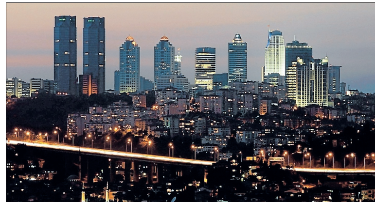
Successful: The modern city of Istanbul.